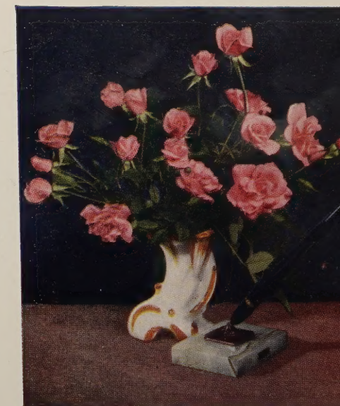
PINKIE (Pat. 712)